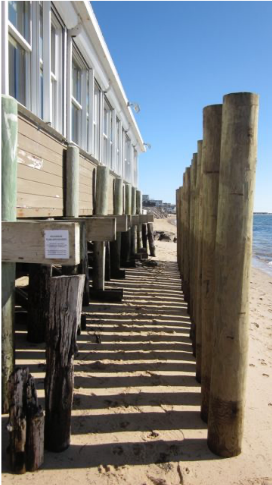
This is a great image illustrating the functional (% open/% closed) symmetry of Safe Harbor's successful wave energy management system. If we manage energy, energy will manage mass.