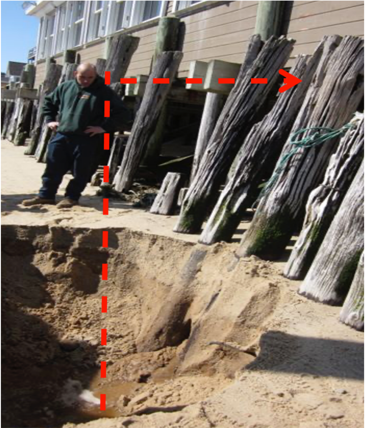
40 foot long pilings, originally installed fifteen feet from building, leaning against Restaurant, after years of storm wave impacts. Since water is not compressible, storm waves pushed the pilings against the Restaurant. Subsequent very large storms (on average every 6-10 years) now had access to the Restaurant. When Safe Harbor was asked to replace the pilings, we were not going to recreate the same problem. Instead, we decided to experiment with a simple difference in pile spacing. We created these alternative spaces for the waves to be driven into, where wave energy could be resolved and stop driving the waves.