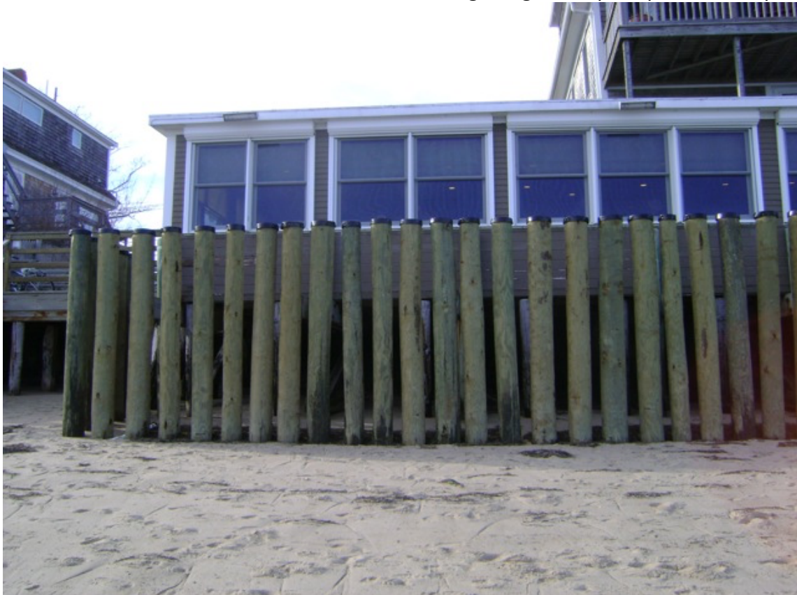
The innovative piling system Safe Harbor designed, provided pathways for wave access but when Storm waves were forced through those pathways, the energy driving the waves would be expended (managed), sometimes explosively and only inert water mass would remain