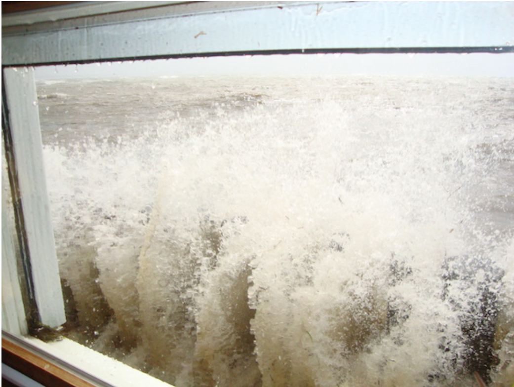
Image below: Close up of wave energy management system functioning, with wave energy being resolved and no damage to the adjacent Restaurant, a few inches away.

Safe Harbor image above: Illustrates storm wave energy management strategy.