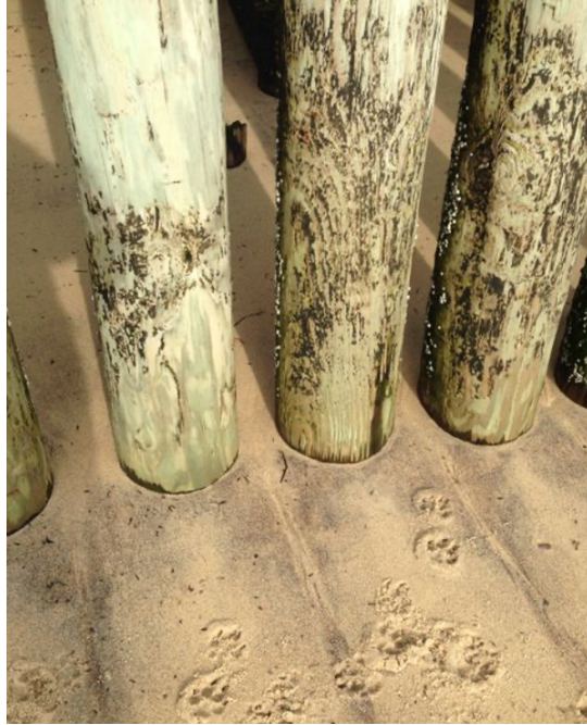
Image above showing conditions at grade after nearly 20 years of use: No erosion; no accretion; no destabilization and no change in vertical piles, following nearly two decades of storms.