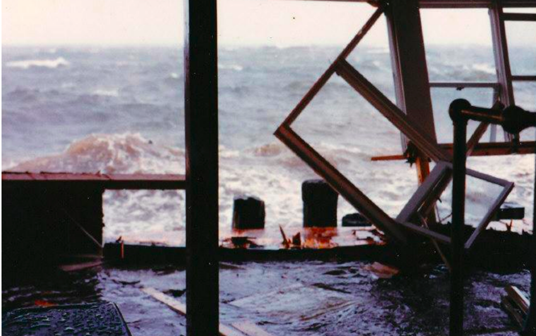
Safe Harbor was called in because the Restaurant was getting destroyed by waves every 6 yrs.