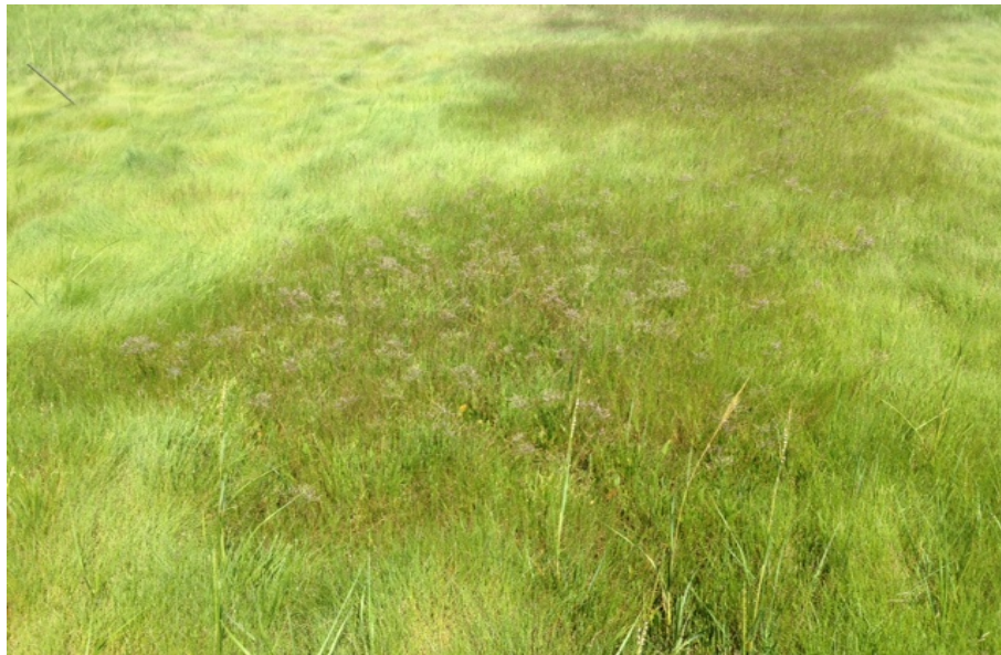
Subtle elevation differences in a Chatham high marsh create microhabitats with differences in salt-water stress and diversity.

Each co-factor envelope has some degree of fluctuation during a given year, decade or century. Habitat is defined by combining all of the co-factor fluctuations into a synergistic envelope. Site-specific habitat envelopes have built in limits to diversity, based on specific combinations of stressors. Anomalous Stress may be part of what is referred to as “Disturbance Regime”, caused by mega scale events on a regional scale.